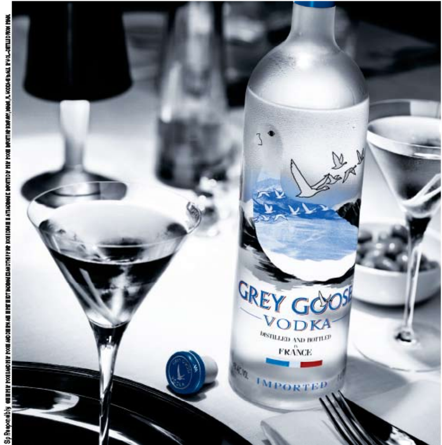
Sip responsibly. 40% ALC/VOL (80 PROOF) AND 50% ALC/VOL (100 PROOF) VODKA. 100% GRAIN NEUTRAL SPIRITS. IMPORTED BY GREY GOOSE VODKA, LLC, WOODBRIDGE, VA. © 2009 GREY GOOSE VODKA, LLC.